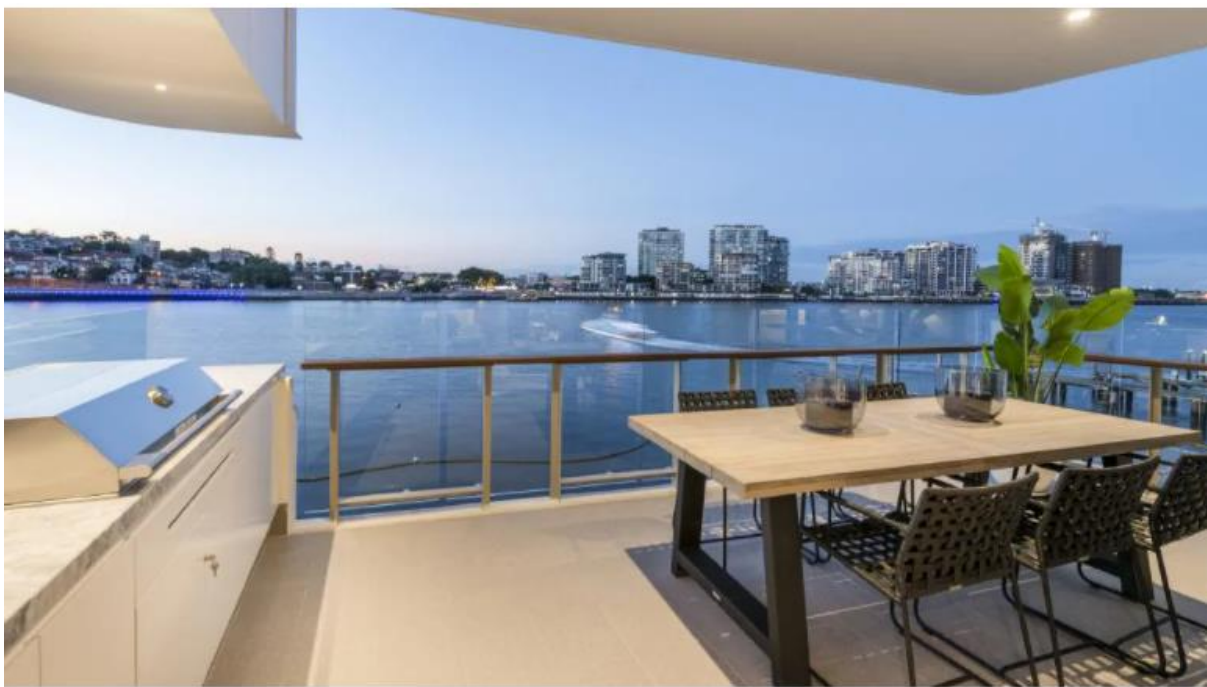
📷 Outlook from the balcony at the Boatyard Bulimba.

It was previously the site of prominent boatbuilding firm Norman R Wright and Sons.