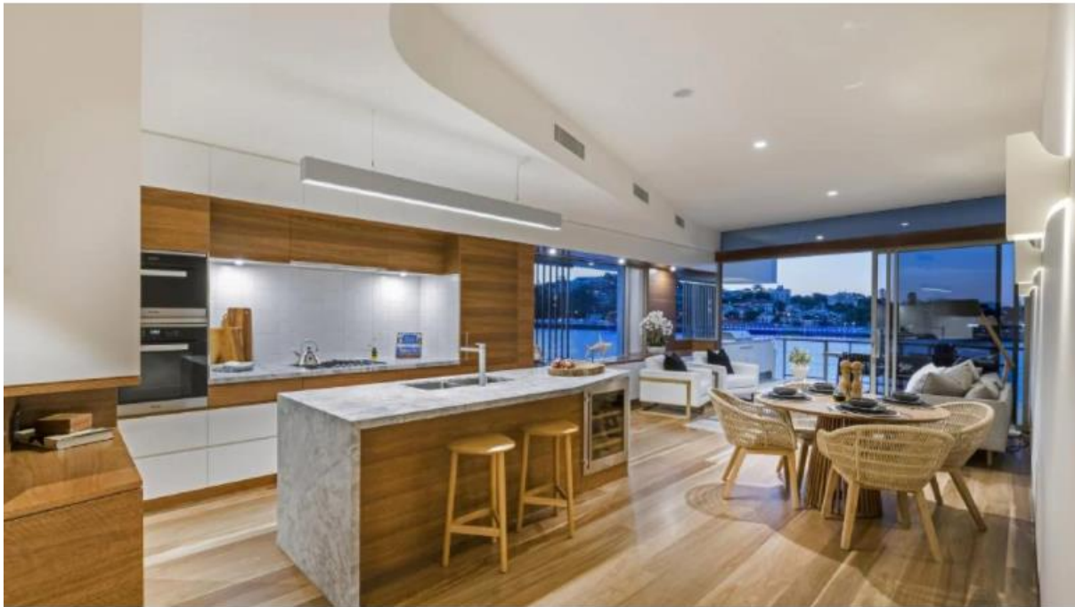
Living space in the Boatyard Bulimba.

“In addition to the four remaining riverfront apartments with four bedrooms and an additional media room, there is only one spacious two-bedroom apartment with a 108 sqm floorplan, priced at $805,000, that remains on the market.”